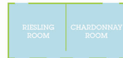
LOCATED IN TOWER B