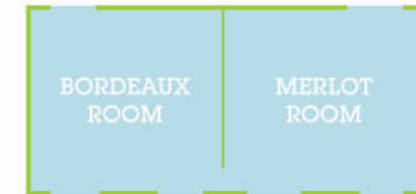
LOCATED IN TOWER A